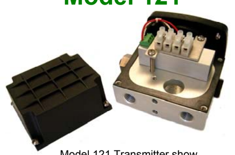
Model 121 Transmitter show with NEMA 4X plastic cover