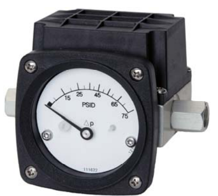
Model 121 0-75 PSID 2-1/2" Dial. Shown with End Connections & Transmitter