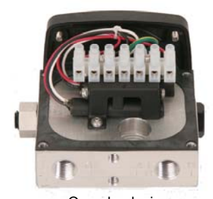
Open back view Model 121 reed switch with terminal strip