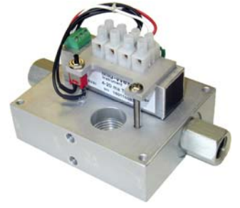
Open view Model 121 Transmitter 4-20 mA terminal strip w/ 1/4" FNPT end connections

Piston-Type Differential Pressure Gauges are available with one or two hermetically sealed reed switches. The switches are adjustable within a defined percentage of the full scale range of the gauge and are available in SPDT and SPST, normally open or normally closed configurations for various load/power ratings. The switches can be set to activate or deactivate on rising or falling pressure. Switches are "CE" marked per the EU low voltage directive. Models 121 can be configured for use in Hazardous Locations.